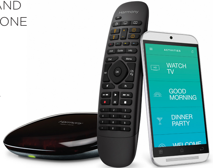
Remote also available in white

Logitech Home Control integrates connected lights, locks, blinds, thermostats, sensors, home entertainment devices and more 1 —all controllable from your Harmony remote or Harmony mobile app 2 . Start and control devices in groups or individually, either directly with one touch or on customizable schedules. Works with over 270,000 devices from more than 6,000 brands.