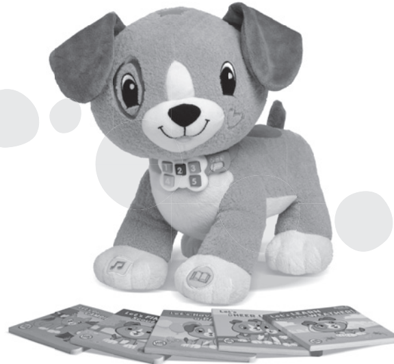
Read With Me Scout* 2+ years