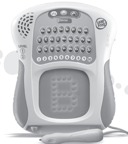
Scribble & Write* 3+ years

Get more ideas to support your child's learning at: leapfrog.com/learningpath