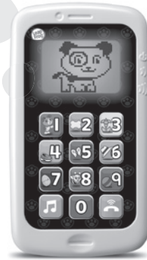
Chat & Count Smart Phone* 18+ months