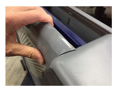
Fig. A Fig. B Fig. C