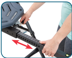
Figure 7 Labeled ① Set Height right on the equipment!