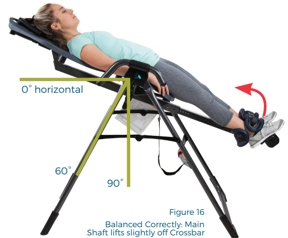
Figure 16 Balanced Correctly; Main Shaft lifts slightly off Crossbar

Your Main Shaft setting should remain the same as long as you continue to use the same Roller Hinge setting and your weight does not fluctuate substantially. If you change your Roller Hinge setting, you should test your balance and control again.